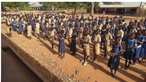
Figure 2.3 - Assembly and lesson at an RC Primary School in urban Upper East