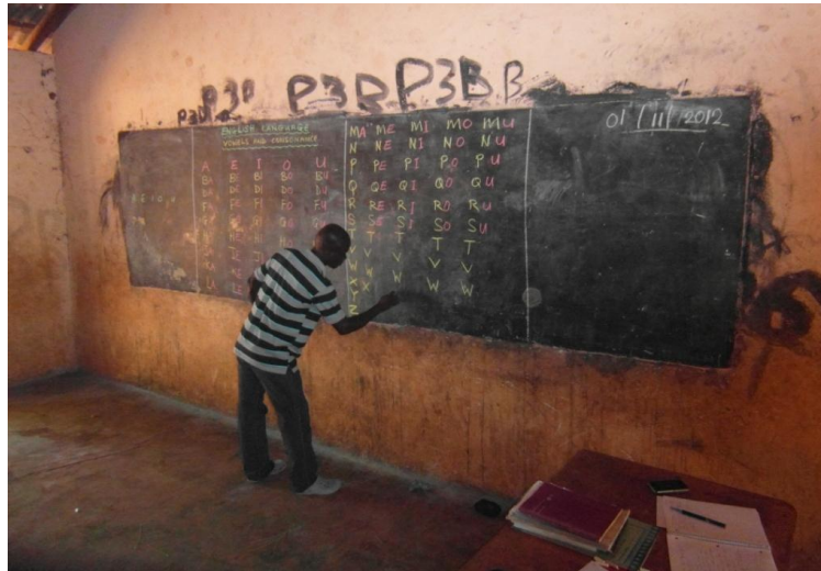
Fig 4.1 - Preparation for English lesson to practise 1 and 2-letter sounds (Upper East)